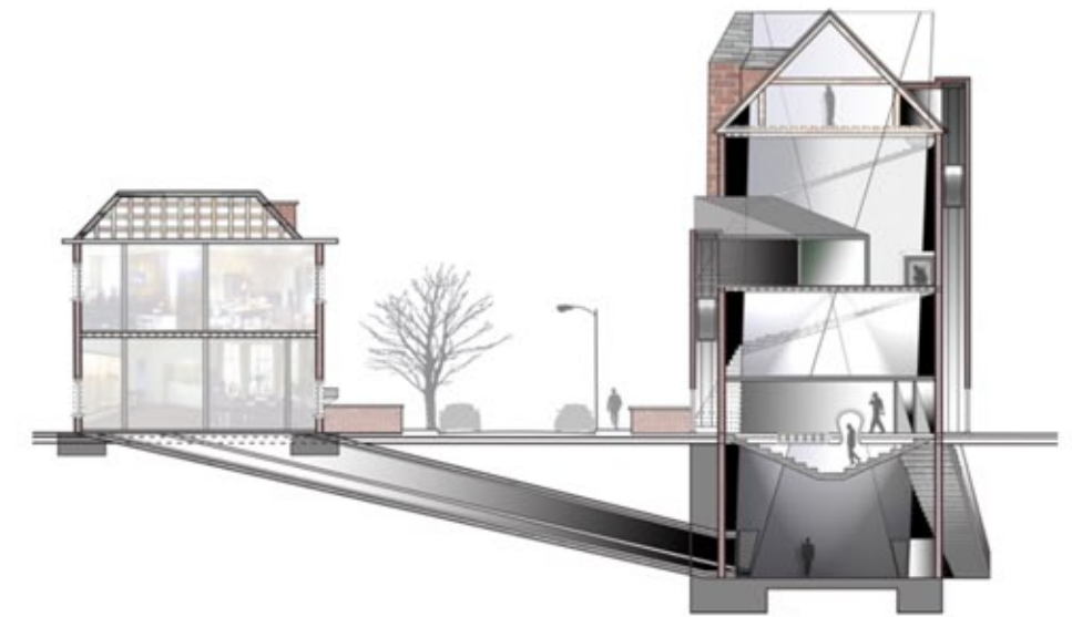
BA 3D Design - Spatial & Interior Designer (including public spaces, museums & performance)