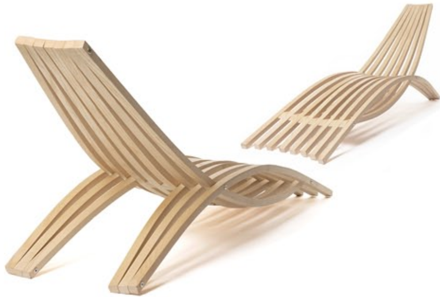
BA 3D Design - Designer Maker (including furniture, lighting, metal & ceramics)